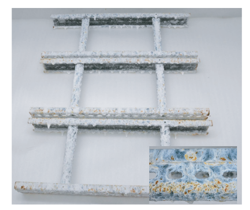
After 768 h red rust has occured. HDG cable ladders fails after 1000 h.

The chart shows the number of hours per class and our Z4 results.