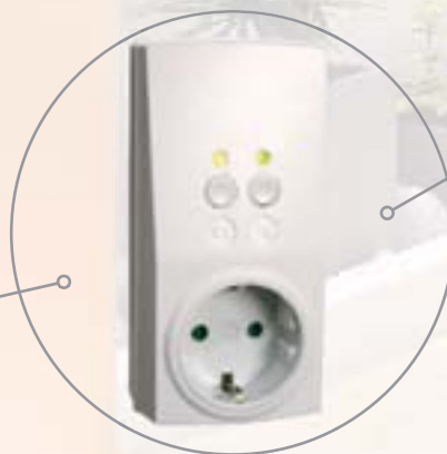
iJaz wireless power switch SP 16

SP 16 is a wireless switch which is controlled by the iJaz central control unit enabling lights and other electric apparatus to be switched on and off.