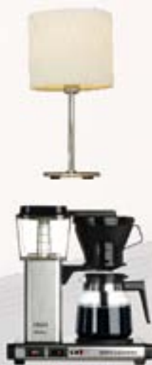
Switch on/off coffee machines, lights and more by SP 16.