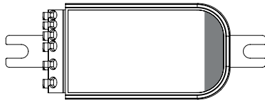
■ Antenna location

When the device is mounted on a metal plate (e.g. frame of a luminaire), it may efficiently block the radio frequency signal. In this case, a cut-out underneath the antenna may be needed for the RF signal to exit the structure. The cut-out area should be as large as possible. Also the device should be placed as far away from any vertical metal structures as possible.