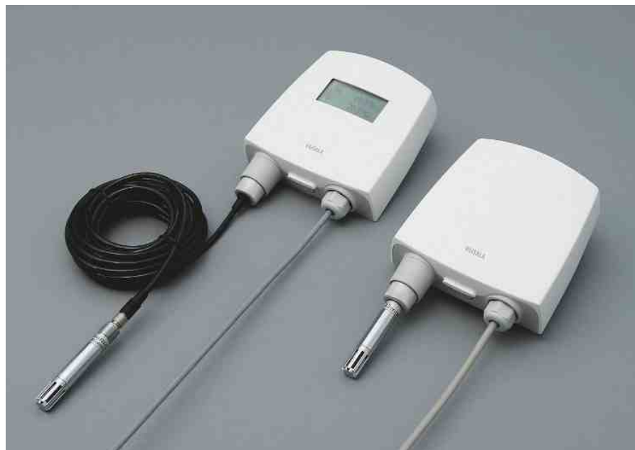
The HMT120/130 with and without a display.

The Vaisala HUMICAP® Humidity and Temperature Transmitters HMT120 and HMT130 are designed for humidity and temperature monitoring in cleanrooms and are also suitable for demanding HVAC and light industrial applications.