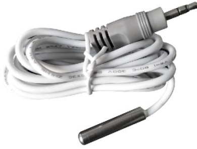
Temperature sensor (1 pcs)