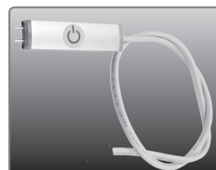
Push-in connector with OnOff switch