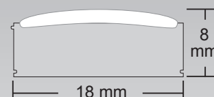
LEDLine - LED light pack in several dimentions with assembling possibilities