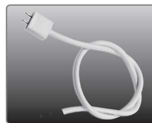
Push-in connector without switch