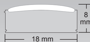
LEDLine - LED light pack in several dimentions with assembling possibilities