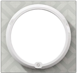
LedgeCircle with sensor