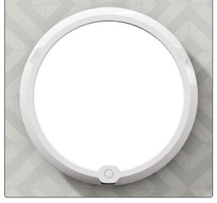
LedgeCircle without sensor

Dimming with trailing edge dimmers. (more information will follow).