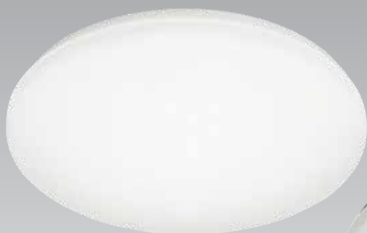
Olympia LED - LED Detect