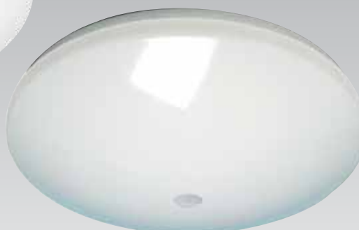
Olympia LED PIR