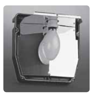
Reflector of high quality alu. giving high light output

Cable entry in the center from behind \emptyset 13,5 mm, and knock outs on top and from both sides of the fitting. Cable glands incl. Prepared for through wiring if requested. Terminal block 4x4mm<sup>2</sup>.