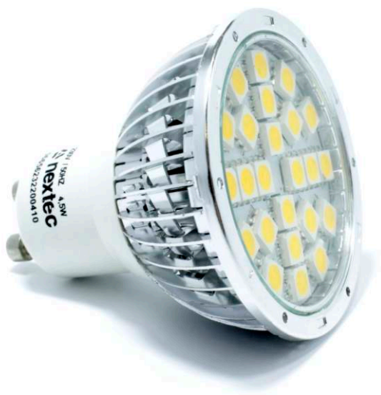
GU10 SMD 24x5050