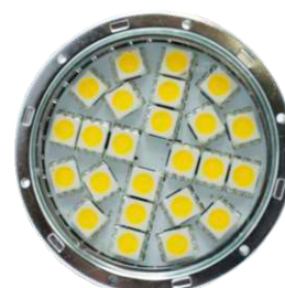
GU10 SMD 24x5050