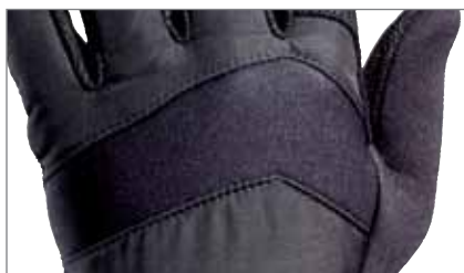
WIND AND WATER RESISTANT BACK Lined with Thinsulate™.