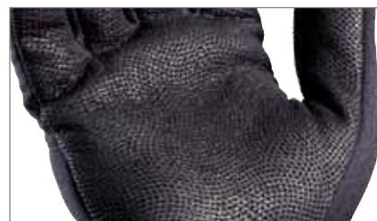
SEAMLESS PALM Designed for maximum dexterity.