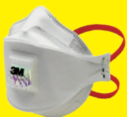
3M™ Aura™ 9300+ Gen3 Third generation flat fold respirator.

Safety and comfort are a top priority at 3M. The third generation of 3M™ Aura™ respirator brings a number of improvements, combining impressive new technology with ergonomic design. The new 3M™ Cool Flow™ Comfort Valve opens easier, delivering a more comfortable wearer experience.