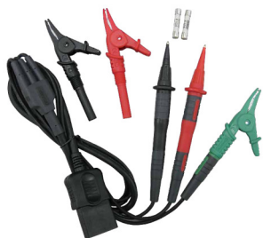
MODEL 7121B (Distribution board test leads)