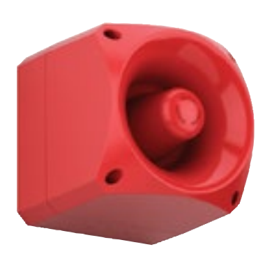
Applications - Fire alarm; conveyors; process control alarm; cranes; moving machinery; general signalling