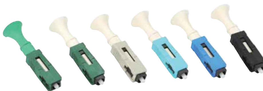
Corning No Polish SC Connector Family