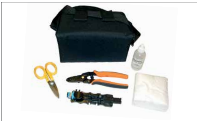
No Polish Connector Kit without cleaver (8865)