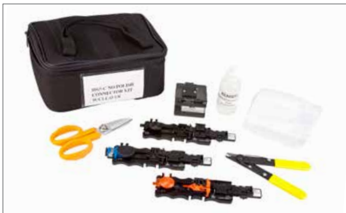
No Polish Connector Kit with CI-01 Cleaver (8865-C)