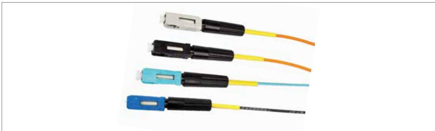
No Polish Jacketed SC UPC Connector Family