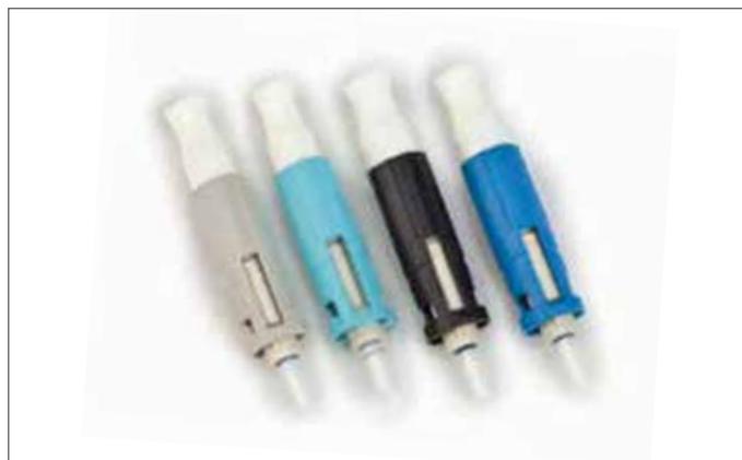
No Polish ST Connector Family