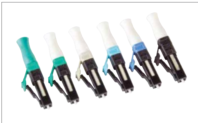
No Polish LC Connector Family