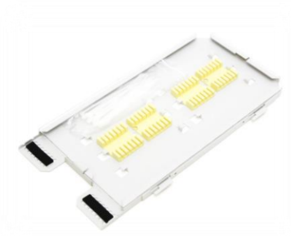
LV1581 NC-48S Universal Splice Tray