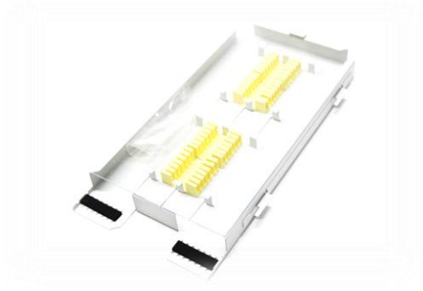
LV2265 NC-96 Universal Splice Tray