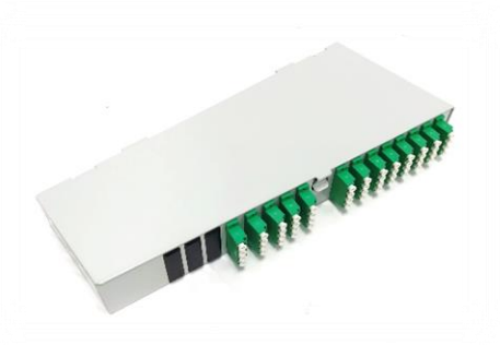
LV2037 NC-320 Connector Panel