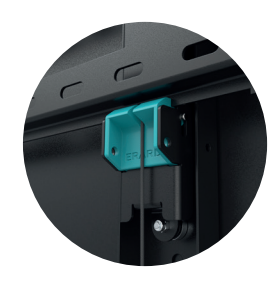
Patented automatic locking system