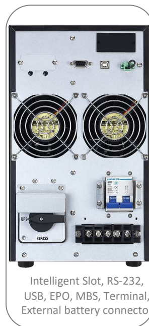
Intelligent Slot, RS-232, USB, EPO, MBS, Terminal, External battery connector