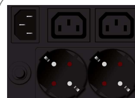
AC Input, fuse, 2x IEC and 2x Schuko outlet